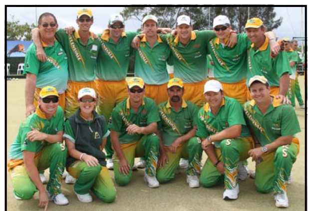
Premier League Champions for 2011 - Helensvale HAWKS