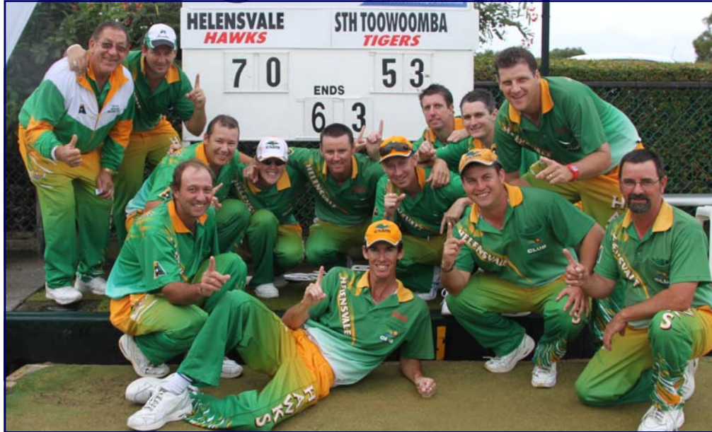
Club Helensvale showed it's strength during April securing not just the Queensland Premier League Top Grade Crown, but the Reserve Grade Trophy as well as the Premier 7's Division 2 and 3 Titles!!