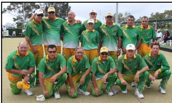
Premier League Reserve Champions for 2011 - Helensvale HAWKS