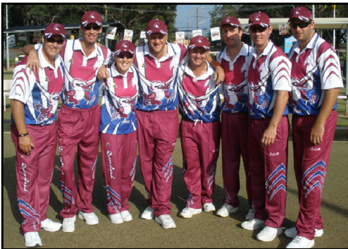
Hawks contingent in the recent QLD team for the Australian side - 8 Helensvale